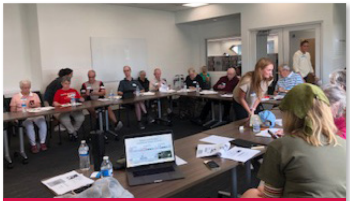
On September 8 OSURA offered a very helpful Technology Information Session. A group of Occupational Therapy students skillfully taught useful functions of our iPhones.