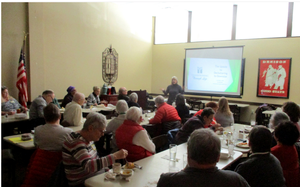
The January Lunch Bunch met at MCL and heard about Decluttering to Downsize!