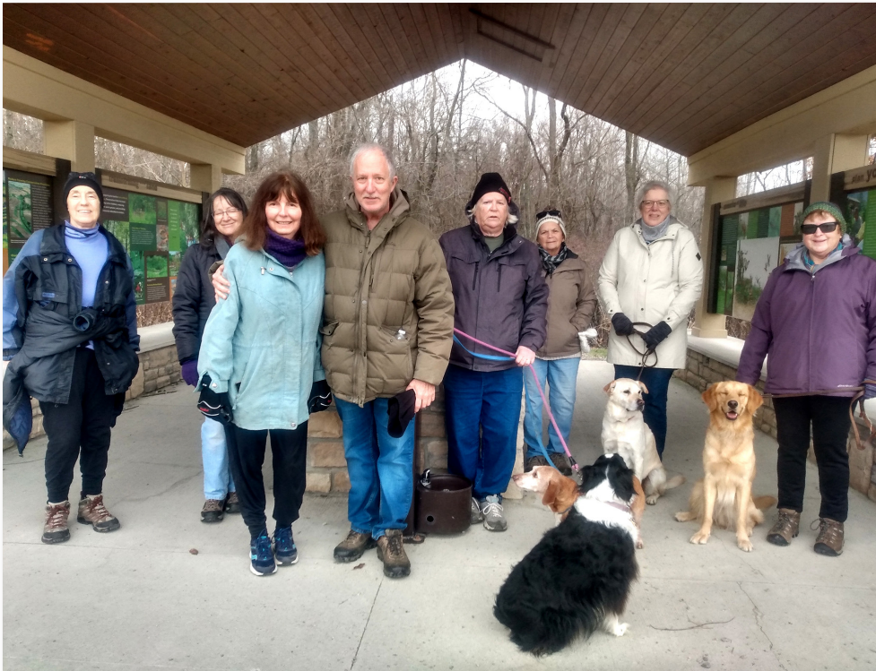
The Hiking Group is going to the dogs! They had a great walk at Alum Creek Park on Jan. 13.