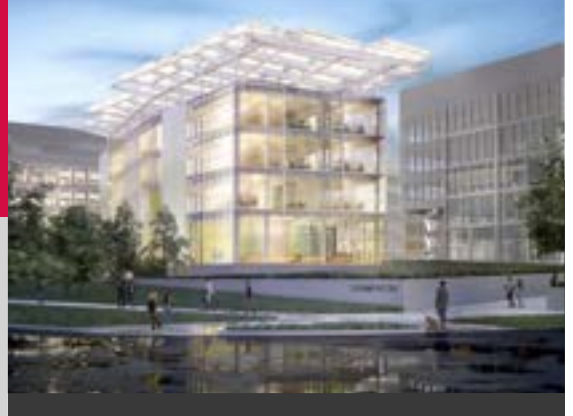
Above: The Innovation District "Carmenton" Below: The new Theater Arts Building